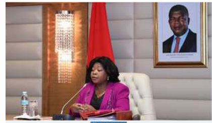
02 APR 2025 VICE-PRESIDENT ESPERANÇA DA COSTA GUIDES SESSION ON ROAD SAFETY