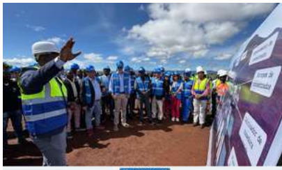
02 APR 2025 DIPLOMATS IN ANGOLA WORK ON IDENTIFYING BUSINESSES ALONG THE LOBITO CORRIDOR