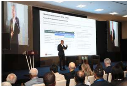
03 APR 2025 MINISTER JOSÉ DE LIMA MASSANO POINTS TO FOOD SECTOR GROWTH OF 18 PERCENT IN 2024