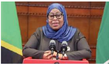
07 APR 2025 TANZANIAN PRESIDENT BEGINS OFFICIAL VISIT TO ANGOLA