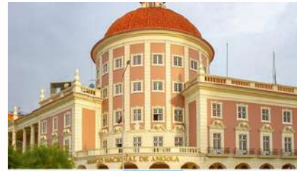
07 FEB 0025 BNA: CREDIT TO THE ECONOMY REACHES KZ 7.7 BILLION