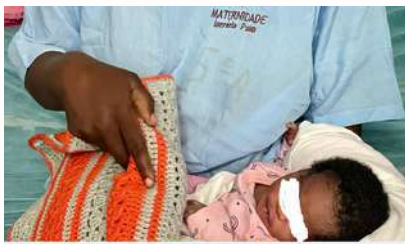
08 APR 2025 WHO - MATERNAL AND CHILD HEALTH IN ANGOLA MAKES SIGNIFICANT PROGRESS