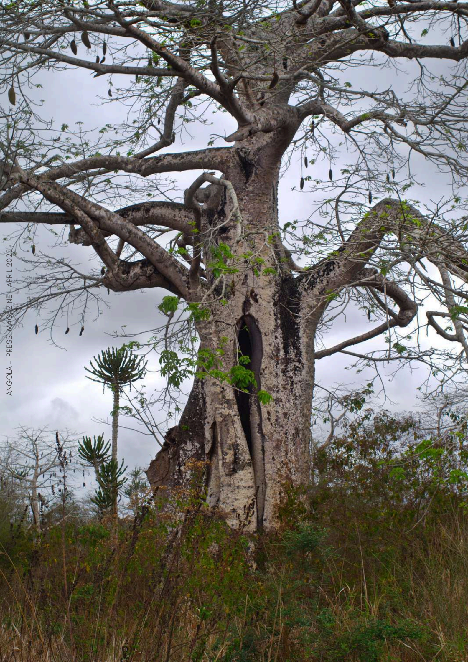
ANGOLA - PRESS MAGAZINE - APRIL 2025