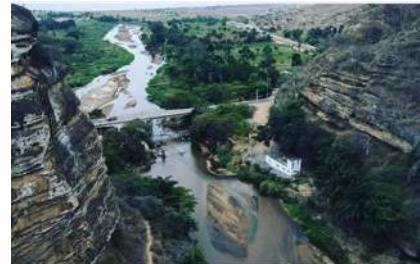
08 APR 2025 ANGOLA HOLDS TOURISM FORUM IN SOUTH AFRICA