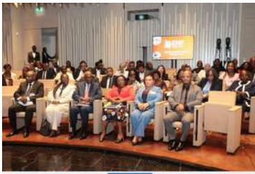
02 APR 2025 NATIONAL BANK OF ANGOLA PRESENTS PUBLIC CONSULTATION ON FINANCIAL INCLUSION PROPOSAL