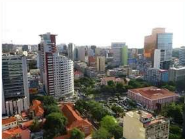
03 APR 2025 LJANDA: US-AFRICA SUMMIT EXPECTS TO BRING TOGETHER OVER 2,500 COMPANIES