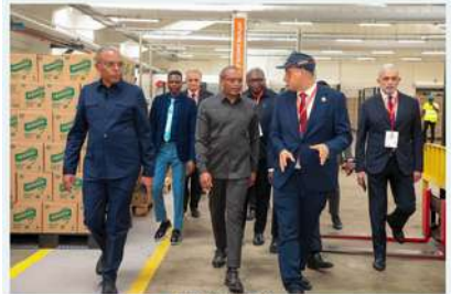
MARCH 10, 2026 Minister José de Lima Massano inaugurates vegetable oil factory in Luanda.