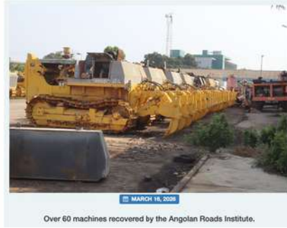
MARCH 18, 2026 Over 60 machines recovered by the Angolan Roads Institute.