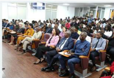
MARCH 25, 2026 Angolan Economic Diplomacy Under Discussion at the Independent University