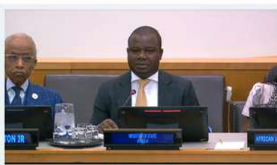
MARCH 26, 2026 Angola votes in favor of resolution for reparative justice for transatlantic trafficking.