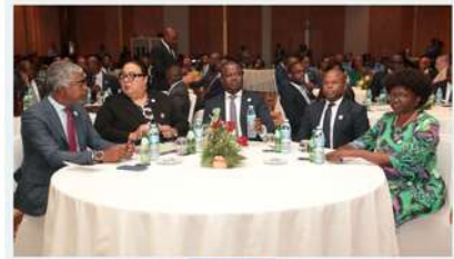
MARCH 6, 2026 Government highlights administrative modernization as a pillar for quality services.