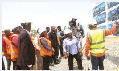
MARCH 9, 2026 Construction of the future fertilizer plant in Bengo will generate more than 400 jobs.