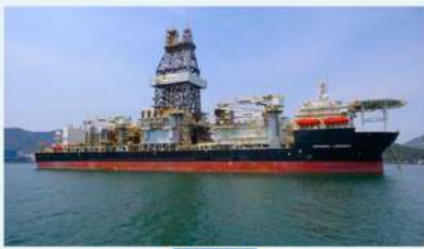
MARCH 6, 2026 SONANGOL OIL TANKER SUFFERS EXPLOSION IN IRAQI PORT