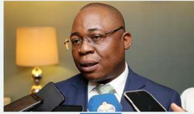
MARCH 18, 2026 President of the Republic appoints Pedro Mendes de Carvalho as the new Attorney General of the Republic.