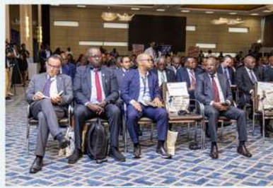
MARCH 6, 2026 Angola has increased its level of poultry meat production.