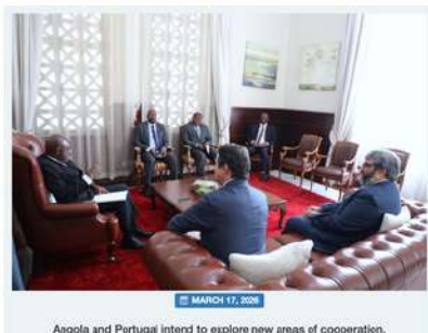
MARCH 17, 2026 Angola and Portugal intend to explore new areas of cooperation.