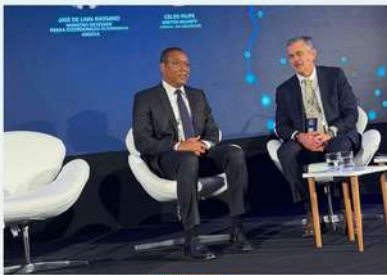
MARCH 9, 2026 The executive branch wants investors to support national production along the Lobito Corridor.