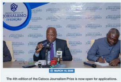
MARCH 16, 2026 The 4th edition of the Catoca Journalism Prize is now open for applications.