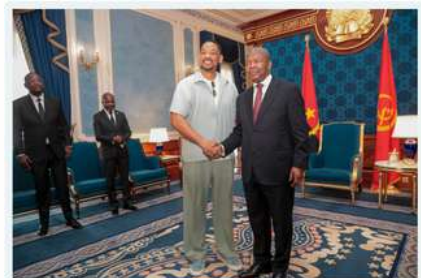
MARCH 26, 2026 President of the Republic receives Will Smith