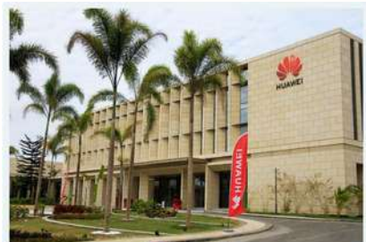
MARCH 12, 2026 HUAWEI ANGOLA PROMOTES APPLICATIONS FOR NATIONAL TALENT DEVELOPMENT PLAN IN INFORMATION AND COMMUNICATION TECHNOLOGIES