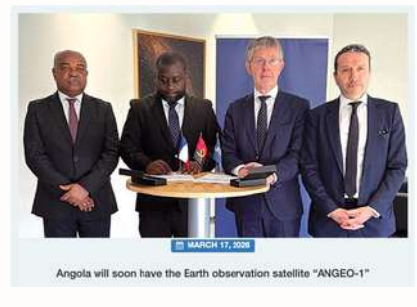
MARCH 17, 2026 Angola will soon have the Earth observation satellite "ANGEO-1"