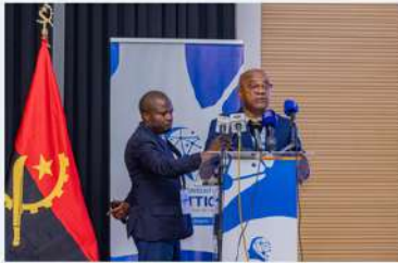
MAR 26, 2026 Minister Mário Oliveira: "Digital transformation will only make sense if it is inclusive."