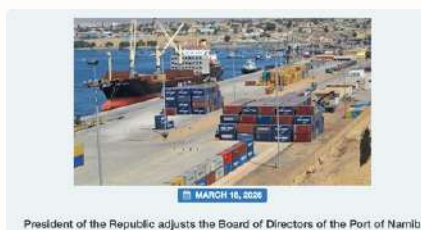
MARCH 16, 2026 President of the Republic adjusts the Board of Directors of the Port of Namibe