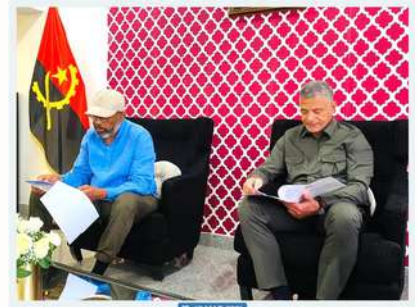
17 MAR 2026 MINISTRO DA ENERGIA E ÁGUAS TRABALHA NO NAMIBE