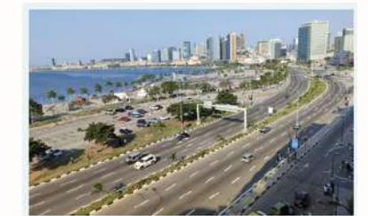
MAR 31, 2026 Luanda hosts international conference commemorating 24 years of peace and national reconciliation.