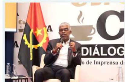
MAR 30, 2026 Minister of Transport considers tourism sector a driver of economic diversification.