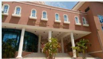
MARCH 20, 2026 President of the Republic appoints eight judges to the Supreme Court.