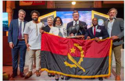
MARCH 9, 2026 Angola and the National Geographic Society hold institutional meeting in the USA.