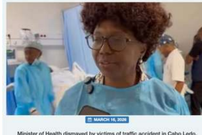
MARCH 16, 2026 Minister of Health dismayed by victims of traffic accident in Cabo Ledo.