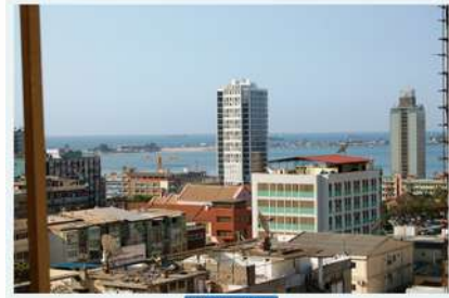
MAR 27, 2026 Luanda hosts event on cervical health.