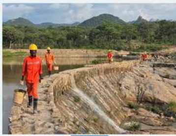
MARCH 19, 2026 Minister João Baptista Borges assesses the degree of execution of various projects in Namibe.