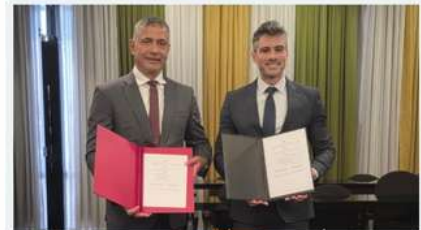
MARCH 25, 2026 Angola and Brazil sign memorandum of understanding on electricity.