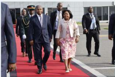
MARCH 9, 2026 President Joao Lourenco in Portugal for the Investiture of António José Seguro