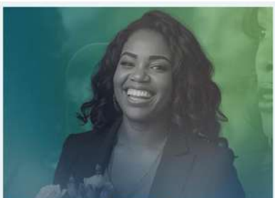
MARCH 11, 2026 AMVM Promotes Recognition Campaign on "Women's Capital" in the Country's Development