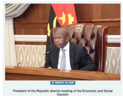
MARCH 19, 2026 President of the Republic directs meeting of the Economic and Social Council.