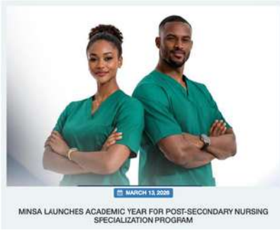
MARCH 13, 2026 MNSA LAUNCHES ACADEMIC YEAR FOR POST-SECONDARY NURSING SPECIALIZATION PROGRAM