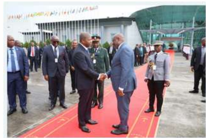
MAR 29, 2026 President of the Republic concludes working visit to Malabo and returns to Luanda.