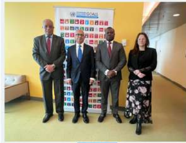
MAR 27, 2026 Angola Strengthens Cooperation with the United Nations