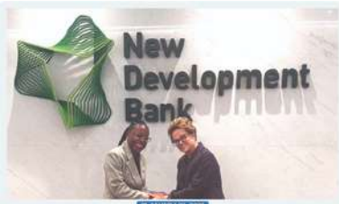
MAR 21, 2026 BRICS WILL SUPPORT STRUCTURAL PROJECTS IN ANGOLA