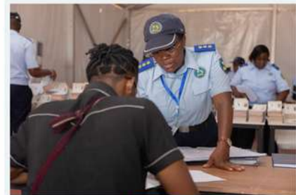
MARCH 20, 2026 Electronic passport issued nationwide.