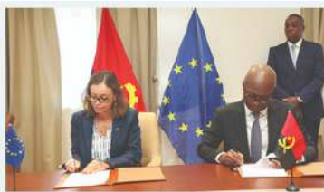
MARCH 25, 2026 Angola and the European Union sign a financial agreement worth 50 million euros.