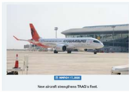
MARCH 17, 2026 New aircraft strengthens TAAG's fleet.