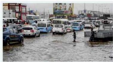
MAR 31, 2026 INAMET FORECASTS HEAVY RAIN WITH THUNDERSTORMS IN THE PROVINCES OF LUANDA AND BENGU.