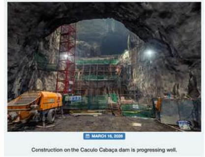
MARCH 19, 2026 Construction on the Caculo Cabaça dam is progressing well.