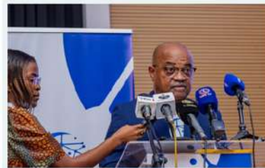
MAR 27, 2026 Angola has more than 28 million mobile subscribers and 16 million broadband users.