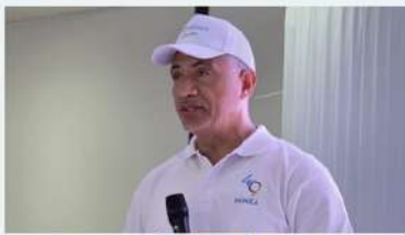
MAR 29, 2026 Ministry of Energy and Water Celebrates 49 Years and Pays Tribute to Workers