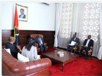
MARCH 20, 2026 Angola and China assess strategic cooperation of common interests.