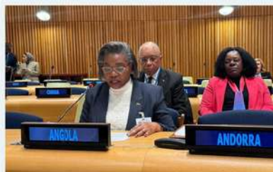
MARCH 11, 2026 Gender equality is making progress but remains a global challenge.