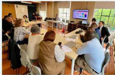
MARCH 10, 2026 Delegation of Directors of Provincial Health Offices Visit Medical School in Brazil