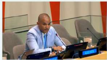
MAR 29, 2026 Internal resources are an essential factor for Angolan sustainable development.