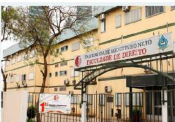
MARCH 26, 2026 US UNIVERSITY PLANS TO OPEN CAMPUS IN ANGOLA