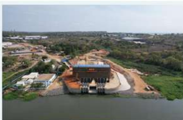
MAR 31, 2026 Construction work on the Quiionga Grande water supply system is progressing well.